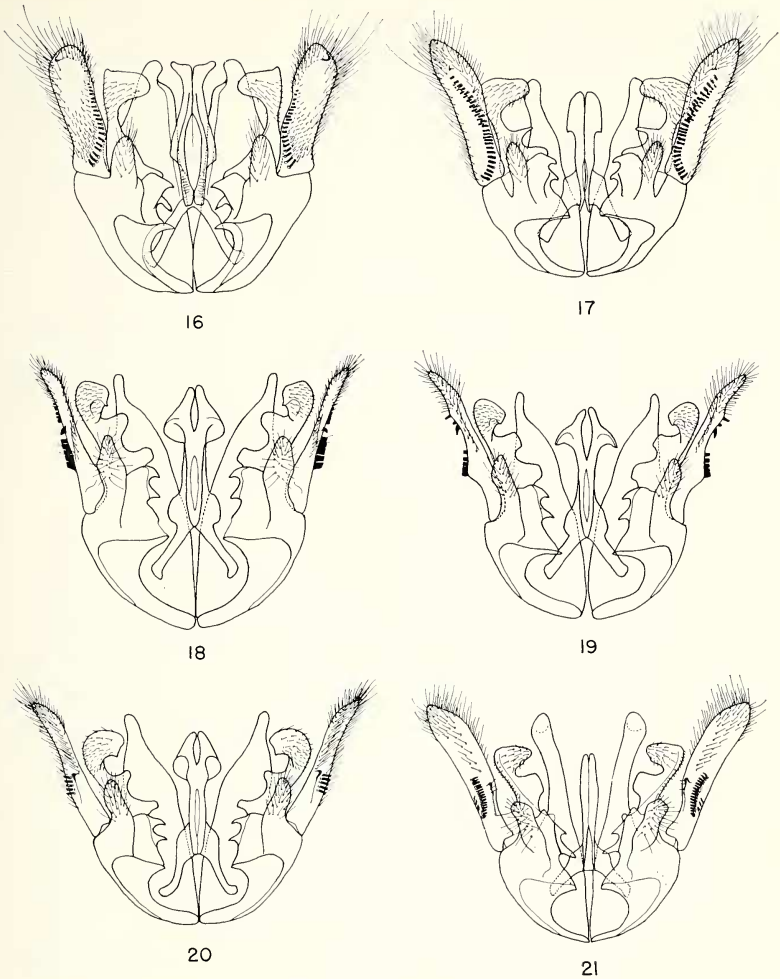
Fig. 16-21. Male genitalia of Chirodamus spp., ventral aspect. Fig. 16. C. imitator n. sp., holotype. Fig. 17. C. longulus Banks. Fig. 18. C. impensus n. sp., holotype. Fig. 19. C. argentinicus Banks. Fig. 20. C. vitreus Fox. Fig. 21. C. fidanzae Holmberg.